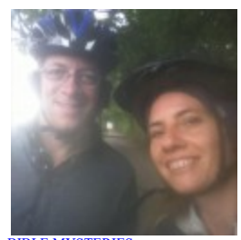
By Tim McHyde / June 4, 2016